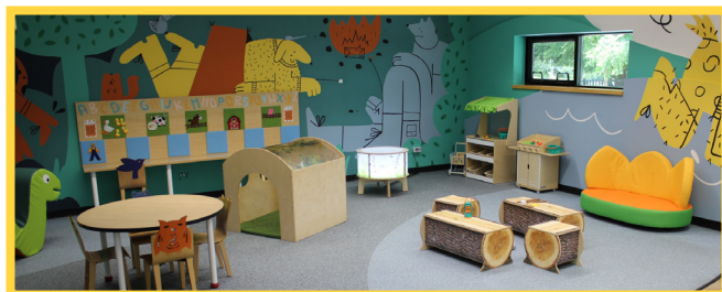
Youth Play Area

Jane Jenkins jjenkins@greenhillslibrary.org